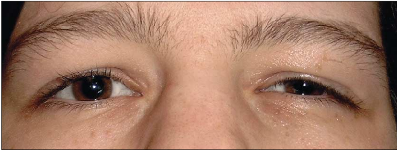
Figure 1: Patient soon after a left-sided cluster headache attack Note the Horner syndrome ipsilateral to the headache and increased facial sweating exclusively around the left eye.

bout, patients may experience one to eight attacks per day, and bouts can last from 7 days to 12 months. 3 While in remission, patients are usually asymptomatic. The chronic form of cluster headache lacks remissions, and is diagnosed after a year without remission or if remission has lasted less than 30 days. A chronic cluster may arise de novo (primary chronic cluster headache) or evolve from the episodic type (secondary chronic cluster headache).